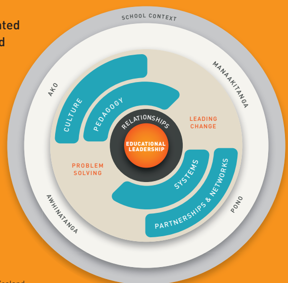
THE EDUCATIONAL LEADERSHIP MODEL

Ministry of Education. (2008). Kiwī Leadership for Principals: principals as educational leaders . Wellington, New Zealand.